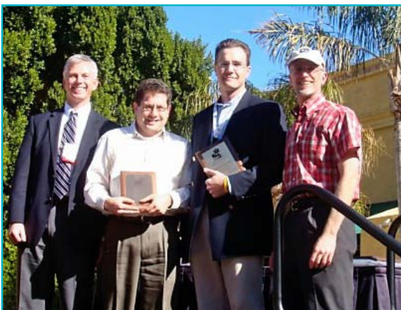
The EMS Fellowship Recognition Award Winners