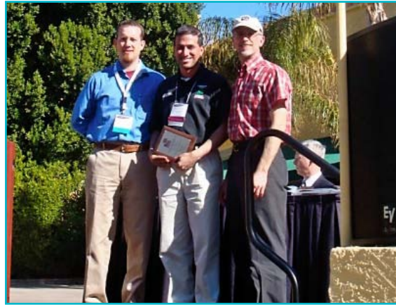
Awards are presented for the best abstracts.